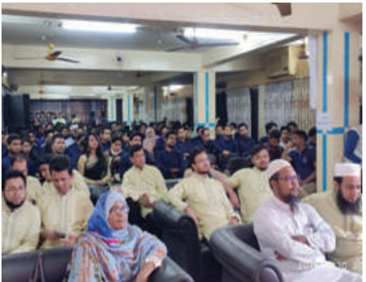
Figure: Farewell Program of 52th, 54th and 55thbatch (2nd shift) CSE DIU