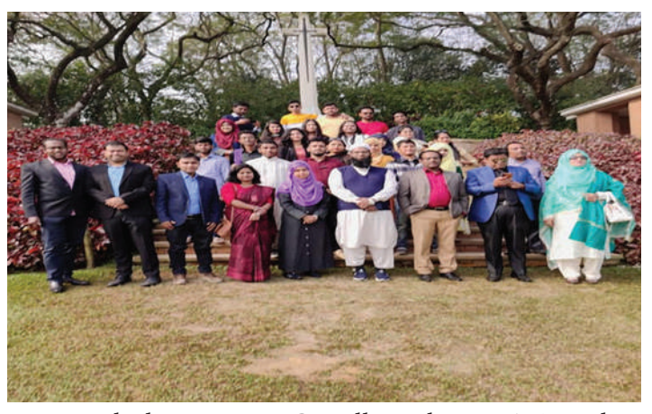
Historical Place Visit at Cumilla with 41st A & 45th B Batchesin December, 2019