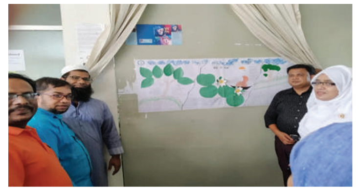
Inauguration of Wall Magazine at the Department of English in October, 2019