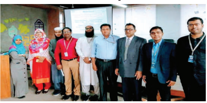
Department of English organized a workshop on Inclusive teaching and learning at the Auditorium of Permanent Campus in December, 2019