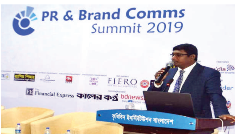
PR &Brand Comms Summit 2019

Sonargaon Folk-Arts and Crafts Museum is the most popular tourist spot in Sonargaon. The original Museum was established by famous painter Joynul Abedin in 1975. Artifacts related to the heritage of Bengal from 17 Century onward are being displayed in this museum. Sonargaon was famous for its production of the finest quality handmade saries among which Moslin was the most famous. This sari was so thin, a whole sari could be folded in a match box. A sample of Moslin and other finest quality saries, Nokshikantha, mattress made of fabrics and brass and many other artifacts are being on displayed in the museum.