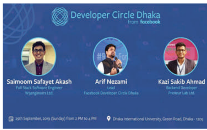
Figure: Workshop on Facebook Technologies for Developers at DIU.