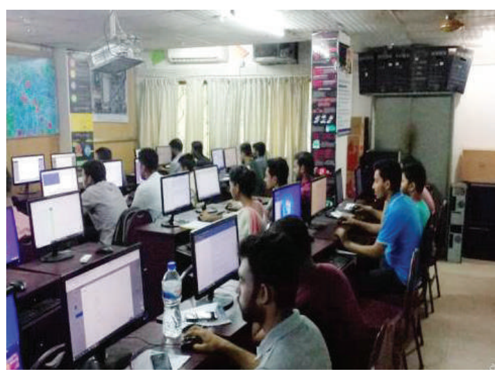
Figure: Intra University Programming Contest - Fall 2019 by CSE, DIU.