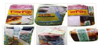
Different Shapes of Bidi Pack