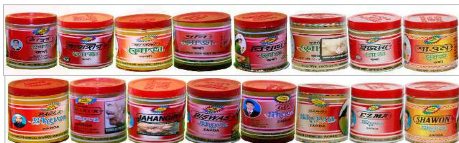
Same Brand by Different Manufacturer