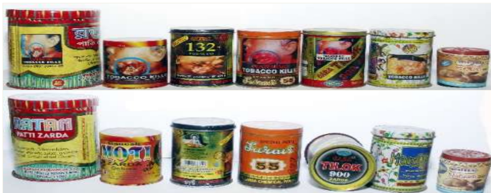
Different Structure of the Pack

Shape- 03 Round & Tall Height-7 to 9cm Diameter-8 to 10cm Quantity-Not mention