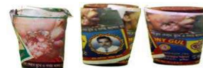
Print GHWs in additional page and attach with Gul pack