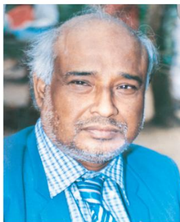
Late Alhaj Professor