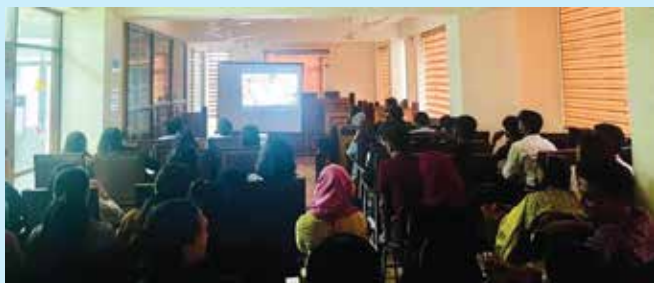
The Department of Law, Dhaka International University, has organized a movie exhibition (On Legal Matter) held on 6 May 2024.